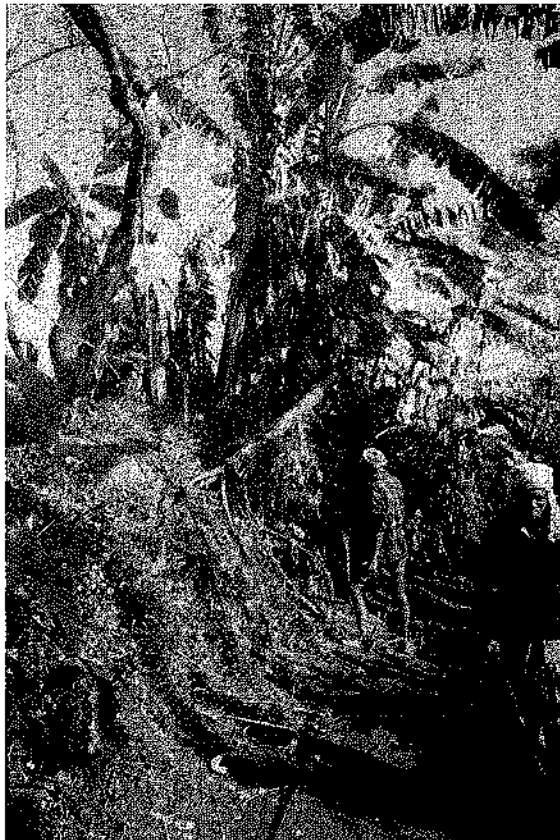
Fig. 1. The government-owned Chiregad irrigation system (right panel) was constructed in Nepal to replace five farmer-owned irrigation systems whose physical infrastructures were similar to the Kathar farmer-managed irrigation system (left panel). In planning the Chiregad system, designers focused entirely on constructing modern engineering works and not on learning about the rules and norms that had been used in the five earlier systems. Even though the physical capital is markedly better than that possessed by the earlier systems, the Chiregad system has never been able to provide water consistently to more than two of the former villages. Agricultural productivity is lower now than it was under farmer management (37). Not only do the farmers invest heavily in the maintenance of the farmer-owned system on the left, they have devised effective rules related to access and the allocation of benefits and costs. They achieve higher productivity than most government-owned systems with modern infrastructure.

Given the substantial differences among CPRs, it is difficult to find effective rules that both match the complex interactions and dynamics of a resource and are perceived by users as legitimate, fair, and effective. At times, disagreements about resource assessment may be strategically used to propose policies that disproportionately benefit some at a cost to others (4). In highly complex systems, finding optimal rules is extremely challenging, if not impossible. But despite such problems, many users have devised their